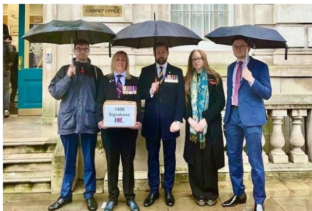
Veteran's Commissioner for England

Last year we launched a petition calling on the UK government to appoint a Veterans' Commissioner for England, as Commissioners in Scotland, Wales, and Northern Ireland are already dedicated to advocating for the veteran community. Over 1,400 supporters, including members, colleagues and volunteers signed the petition we delivered to the Office of Veterans' Affairs in December. Thanks to this work, the Government will appoint a Veterans' Commissioner for England. Read our official statement here . To hear more about our campaigns, sign up to our Campaigner Community .